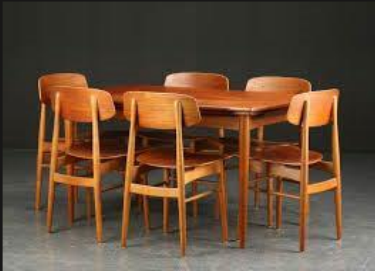
Installation with Table Model 185