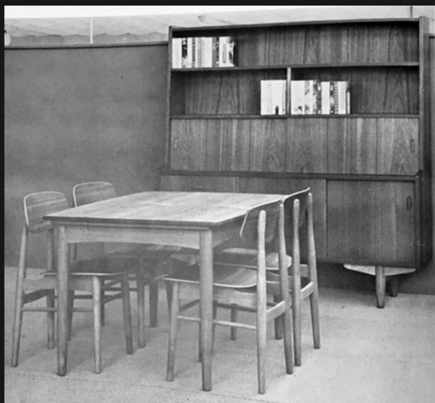
Installation with Dining Table and Cabinet