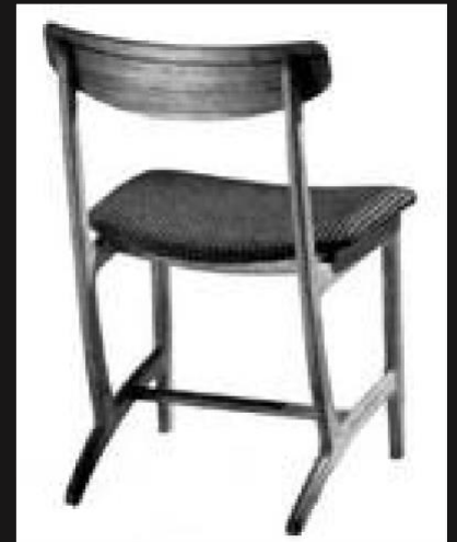
Side Chair Model 55