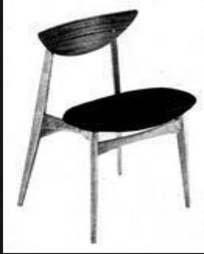
Side Chair Model 56