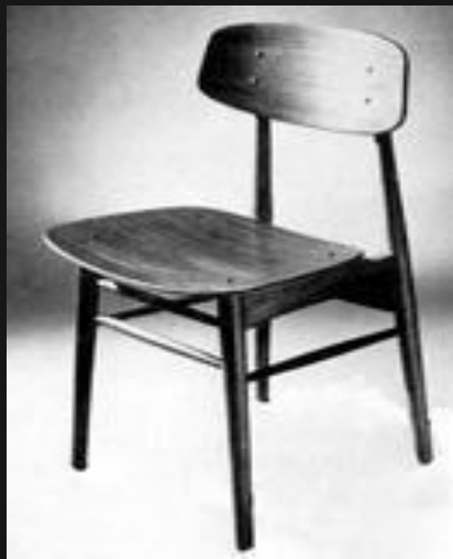
Side Chair Model 188