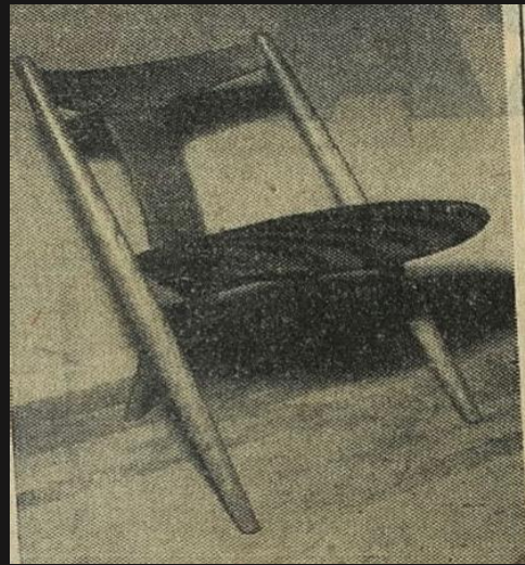
Three-legged Chair Made in 1995